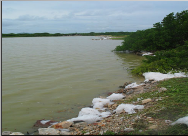
Salt Pond Prior to Flushing Channel Construction