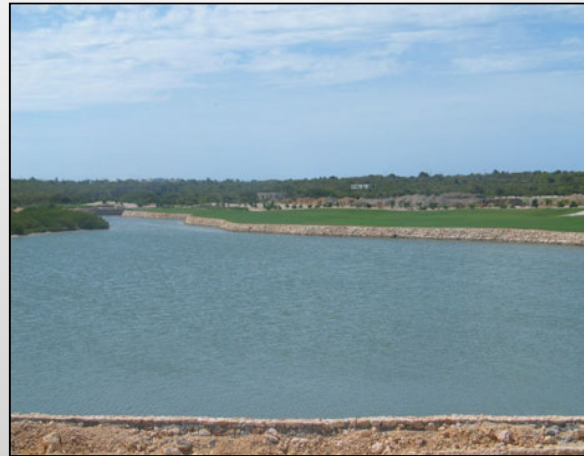
Post-Construction of Flushing Channels – Functional Marine Habitat

Our company has performed a multitude of mapping and hydrologic data analysis projects dealing with coastal hypersaline salt ponds in the Caribbean. The ultimate goal of these projects is to fully convert the anoxic ponds into functional marine habitats that are both aesthetically pleasing and biologically productive. The example shown here is on the island of Anguilla, BWI. Comprehensive geophysical mapping enabled the correct placement of several underground flushing channels that connected the pond to the offshore environment, utilizing tidal flux to flush the system and lower salinities to normal marine levels. Live reef habitat was constructed within the pond, as well as grass flats and additional mangroves.